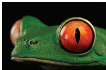
Images (from top to bottom): An endangered Indian rhinoceros female with calf; Aardvark; female African elephant; Oblong-winged katydids; mother koala and her baby; Major Mitchell's Cockatoo; flock of scarlet ibis; Sulawesi macaques; and Red-eyed tree frog .